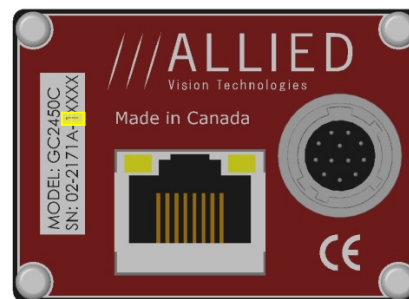
Fig 2. Prosilica GC back, 5-25 VDC Input Power Voltage Range